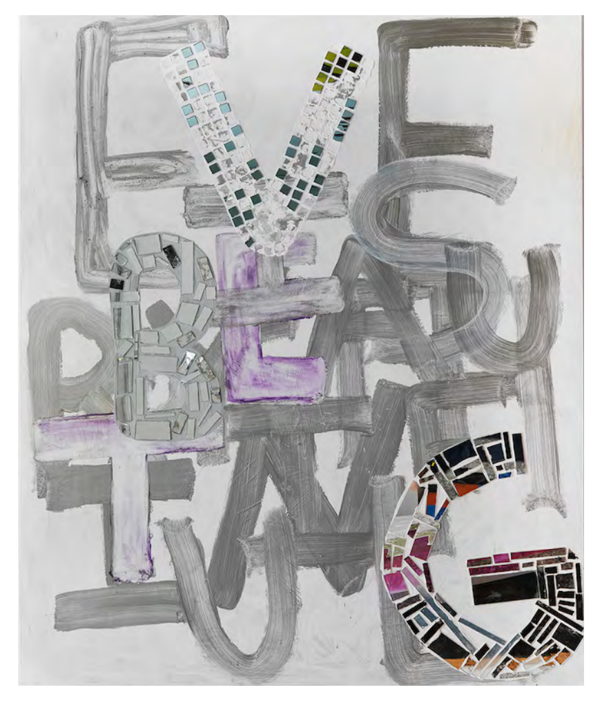
Samuel Jablon, "Beautiful Everythings" (2016), acrylic, mirror and glass tile on wood panel (72x60 inches)

advertisements, and the language or phrases that cycle around those ideas. I'm curious how poetry changes as it is brought into different environments. I find it exciting to jump from a performance, to a painting and then back to a poem.