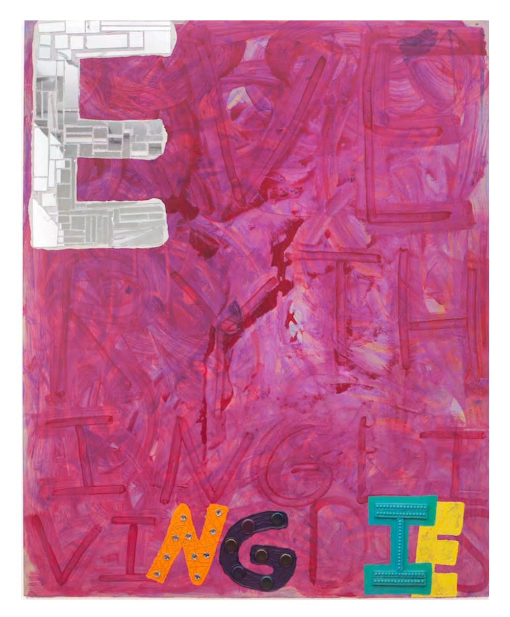
Samuel Jablon, "Life" (2015), acrylic, mirror and glass tile on wood panel (84x68 inches)

RG: A few new paintings you showed me have one word rather than groups. One of your new "Ugly"s for example, looked purple, almost like a sign or symbol. I always think of the quotes having a closed circuit quality, like they don't care about me cause they'll keep doing what they are doing, but simple ones keep pointing elsewhere. A little endless, is this a newer development? Maybe I'm just reading into this.