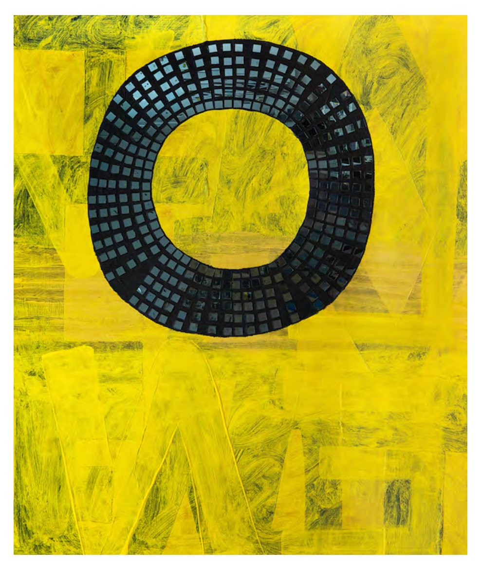
Samuel Jablon, "Loving It" (2016), acrylic and glass tile on wood panel (72x60 inches)

RG: I'm curious about your palette. Can you talk about how color enters in your work?