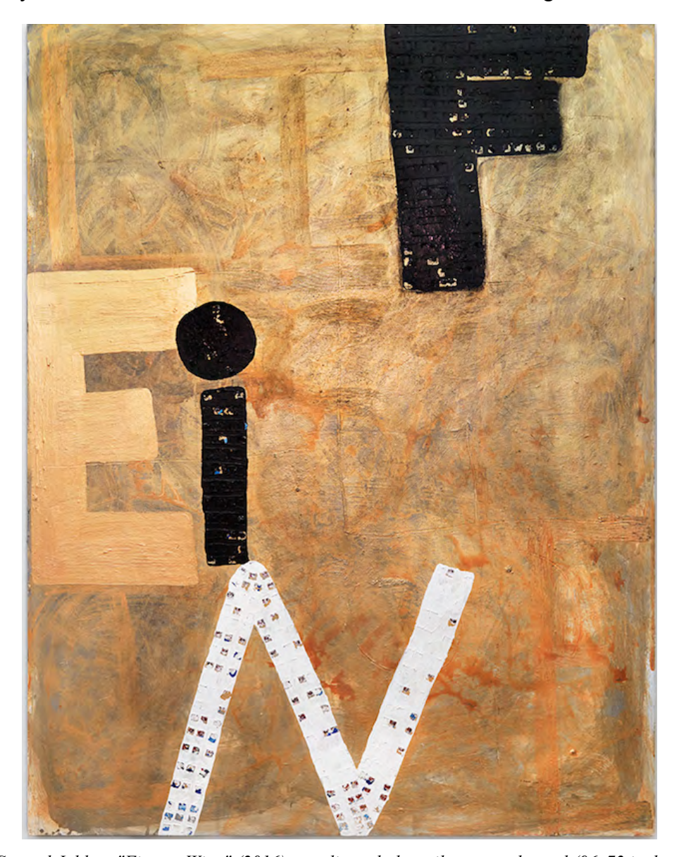
Samuel Jablon, "Fine as Wine" (2016), acrylic and glass tile on wood panel (96x72 inches)

language is the sole content in these works, color and texture hold equal content. I wanted the works to be about painting as much as they are about language. I'm interested in materiality and the tension between what can be seen and what is legible.